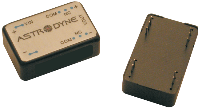
Unit measures 0.8"W x 1.25"L x 0.5"H